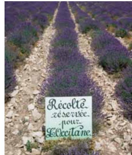
1 st lavender harvest reserved for L'OCCITANE

Since then, the Lavender range has continued to grow, as has our involvement in the local lavender industry.