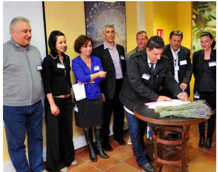
Contracts signed with supply chain partners on February 1 st , 2013.

Through this commitment, L'OCCITANE directly supports the fine lavender supply chain in Haute-Provence.